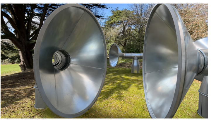
IOU Sound Wave Collider