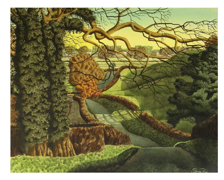
Simon Palmer, Sun Setting on Watlass Moor , 2019. Image © the artist, printed by Paul Berriff, courtesy Yorkshire Sculpture Park.

Observation of Landscape features a collection of 18 limited edition giclée prints of original watercolour paintings. The editions will be available to purchase in YSP Shops and online, with proceeds supporting YSP's charitable work. The prints have been created from Palmer's much